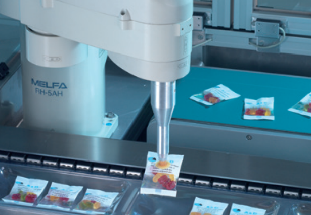
THE A&D MODULAR SYSTEM. For solutions individually configured to your demands.

For detailed information on each version, please visit us online at www.adpack.eu.