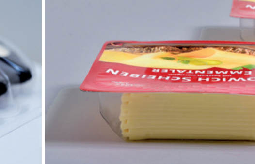
A&D SAMPLE APPLICATIONS.